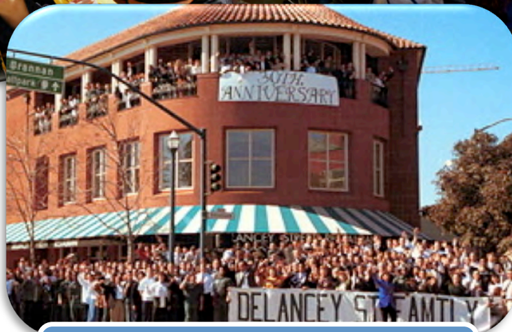
Delancey Street Foundation